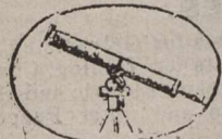
Registered Trade Mark.

Locks in all qualities for Cabinet Makers, Sash Fasteners, Locks & Brassfoundry for Builders' Ironmonger. ALL KINDS OF KEYS MADE on the PREMISES.