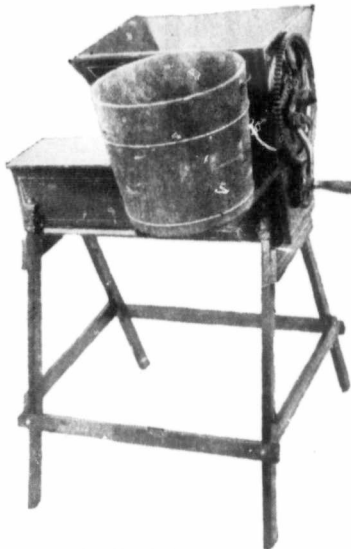
ACME GRAIN PICKLER