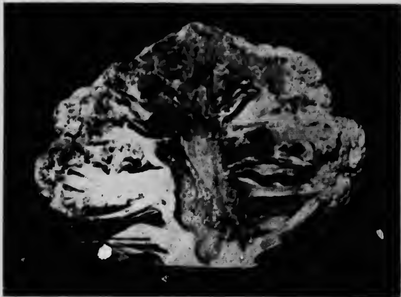
Fig. 8. The edible portion of a cauliflower cut in two with a sterilized knife and inoculated with a pure culture of B. oleraceae by means of a single needle prick in the centre of the flower. Note the blackened portion which was softened to a considerable depth and also the water drops upon the blackened area.