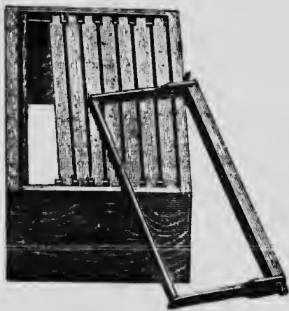
Full Depth Extracting Super E.

In Canada at the present time we have quite a number of different strains of bees, and the beginner is often at a loss to know which is the most suitable for his conditions. The three or five-banded Italian bee has proven more satisfactory than either the common "Blacks" or the Golden Italians. The three and five-banded Italians, as a rule, are easier to handle, show less tendency to swarm, and winter well.