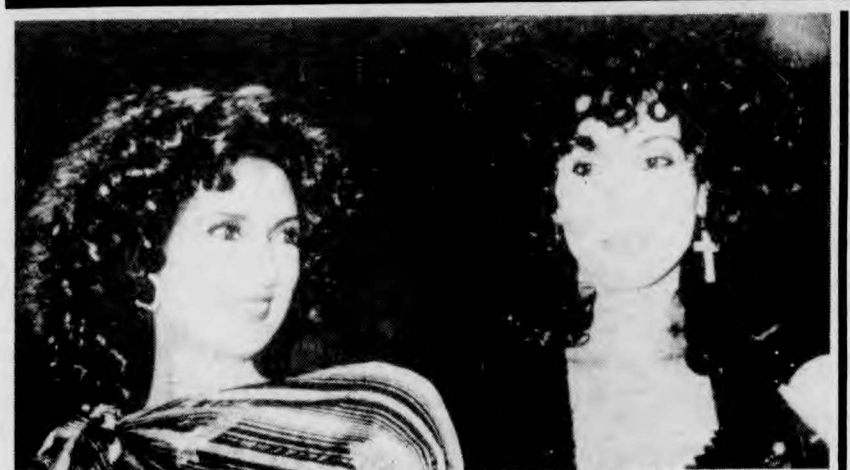
BUT WHERE'S SONNY? Gala guests Norma Aleandro and Cher make their appearance at the Festival of Festivals.