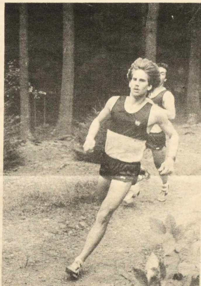
Dal hosts x-country meet

The travel company of CFS TRAVEL CUTS HALIFAX Dalhousie, Student Union Building 902 424-2054