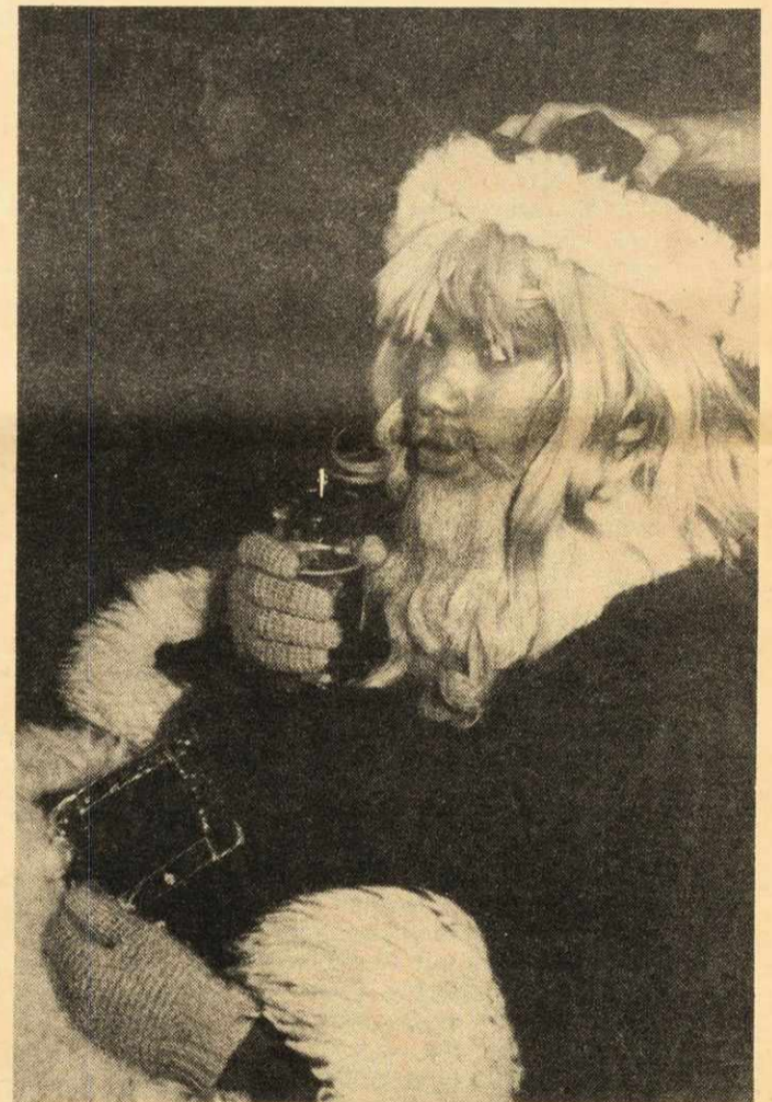
Watch that hand, Santa