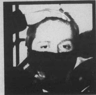
Dark Meeley BSc II "Erotic Rampaging T--s of the World."