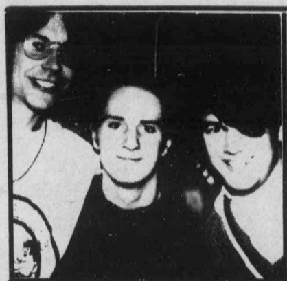
Norm, Ausy, Sif "Alcatraz - No escape."