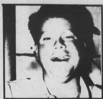
The Captain "Very Pink Floydian."