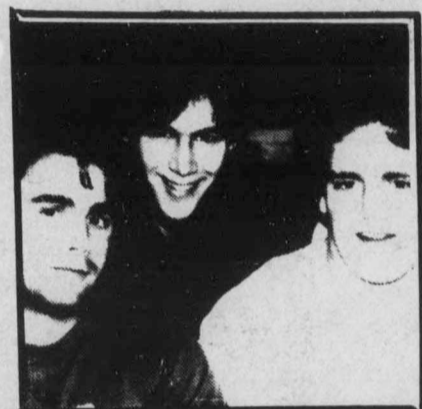
Drunk Bunch "More acid flashback."