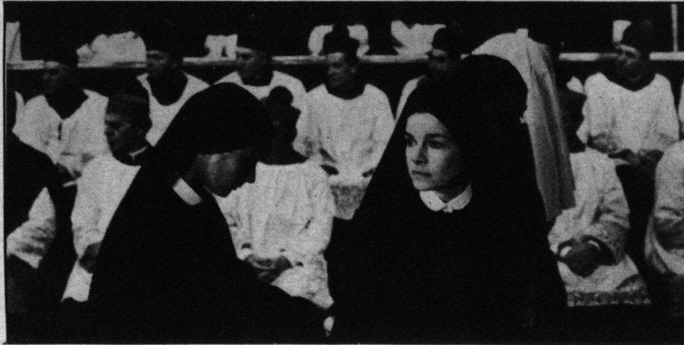
Arnold Schwarzenegger does not star in Nun's Revenge .

My favorite scene took place towards the