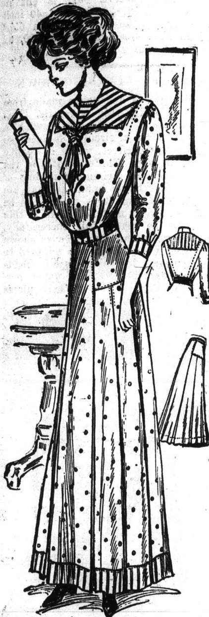
DESIGN BY MAY MANTON. 6577 Sailor Blouse or Shirt Waist. 6438 Bo' Plaited Skirt.

For the medium size will be required, for the blouse 4\frac{1}{4} yards of material 24 or 27, 2\frac{1}{4} yards 44 inches wide; for the skirt 10\frac{1}{2} yards 24, 9\frac{1}{4} yards 27 or 6\frac{1}{4} yards 44 inches wide; to trim the entire gown will be needed 2\frac{1}{2} yards of material 24 inches wide. A May Manton pattern of the blouse No. 6577, sizes 32 to 40 inches bust, or of the