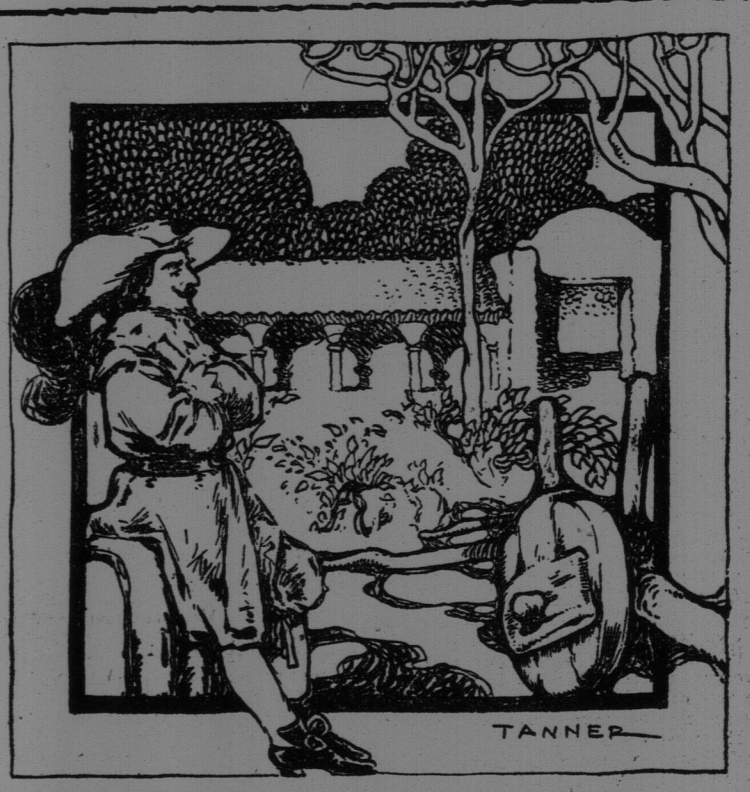
Robinson Crusoe spent four years in B rail as a planter. (Robinson Crusoe, by Defoe.) Find another planter. ANSWER TO YESTERDAY'S PUZZLE Left side down, under window.