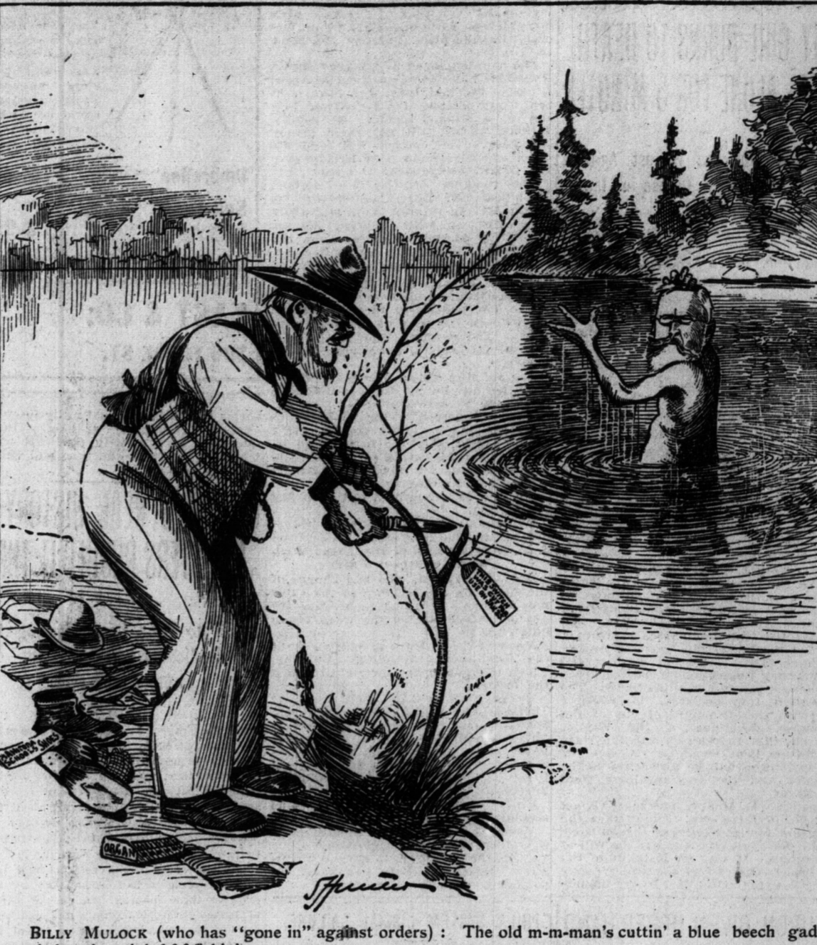
BILLY MULOCK (who has "gone in" against orders): The old m-n-man's cuttin' a blue beech gad—I guess he's on'y goin' 't-f-fishin'.