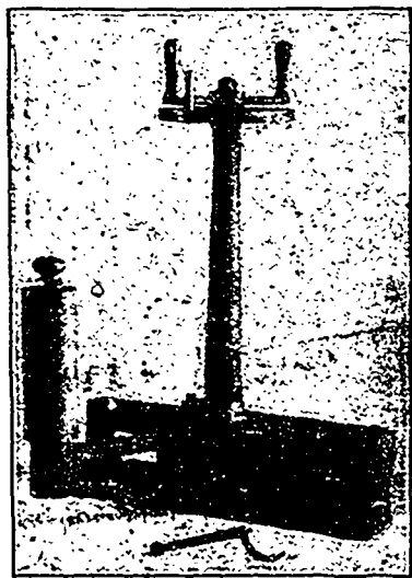
IMPROVED FAIRBANKS ROLLER GAUGE.

Embodies all of the Advance Features of the heavier sizes. It is Light, Rigid and Durable. The carriage excels for handling long timber—can't cut anything but parallel with it, unless you want to.