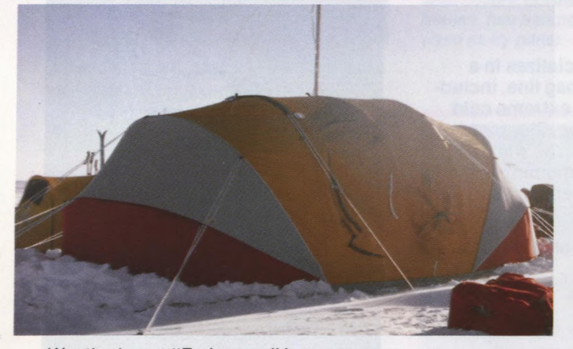
Weatherhaven "Endurance" in use on a ski trip to the South Pole in 1988-89.