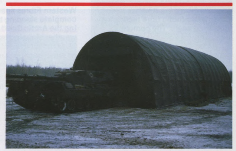
Second line insulated maintenance module for the Department of National Defence.