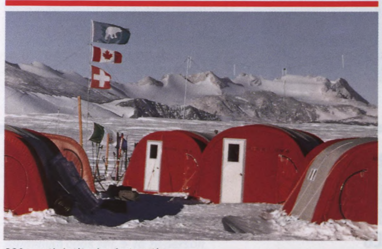
80° south latitude, Antarctica.