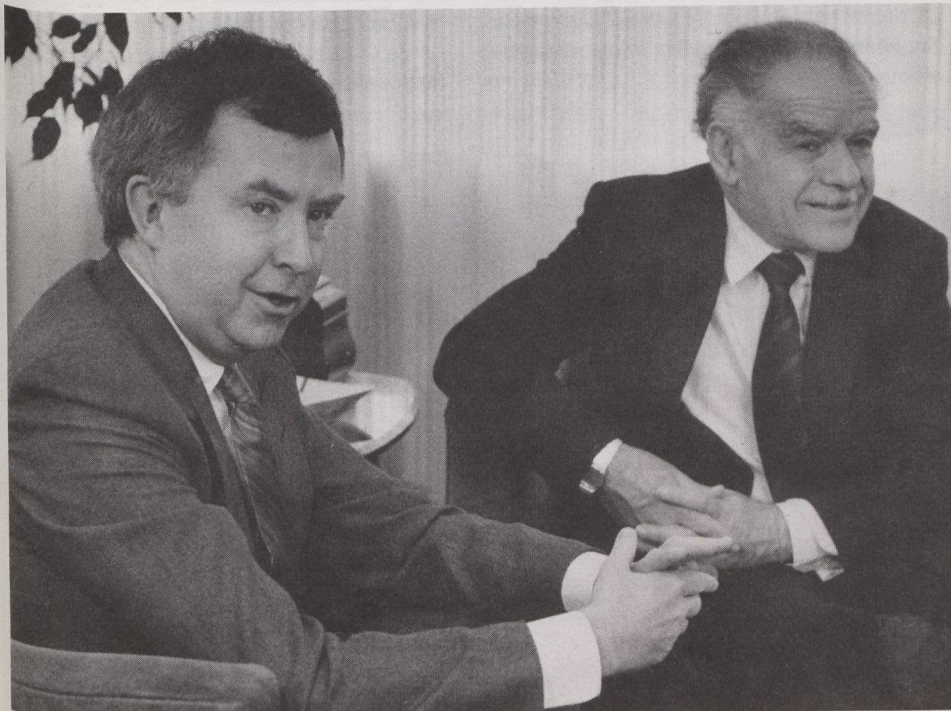
Secretary of State for External Affairs Joe Clark (left) meets with Israeli Foreign Minister Yitzhak Shamir during his visit to Canada in March.

In response to an invitation by Mr. Shamir, the minister for external affairs will visit Israel in the context of a trip he will make to the Middle East this fall to obtain first-hand impressions of the region.