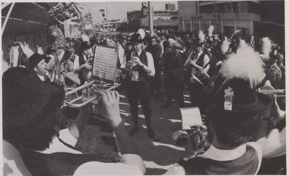
Bands in the street are part of Kitchener-Waterloo's Oktoberfest.

fest", now in its twelfth year, strives to be true to traditional Bavaria. Authentic food, such as pigtails, pork hocks and fried chicken on a stick, are served — all mouthwateringly abundant. Traditional "oompahpah" bands, complete with tubas and trombones, supply the music for Bavarian "slap dancers".