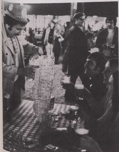
Beer halls are a hallmark of Oktoberfests.

The only Oktoberfest in the Maritimes is the Mahone Bay 'fest, now in its third year. The celebrations last for four nights in this Nova Scotia town of 1,300, just up