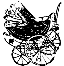
An English Baby Car $25. Model

will prove a most satisfactory gift. It will provide baby with comfort, ease and safety—will relieve mother of the fatigue she would otherwise have if compelled to carry her child. It will provide her also with endless satisfaction and pleasure.