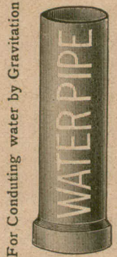
For Conducting water by Gravitation