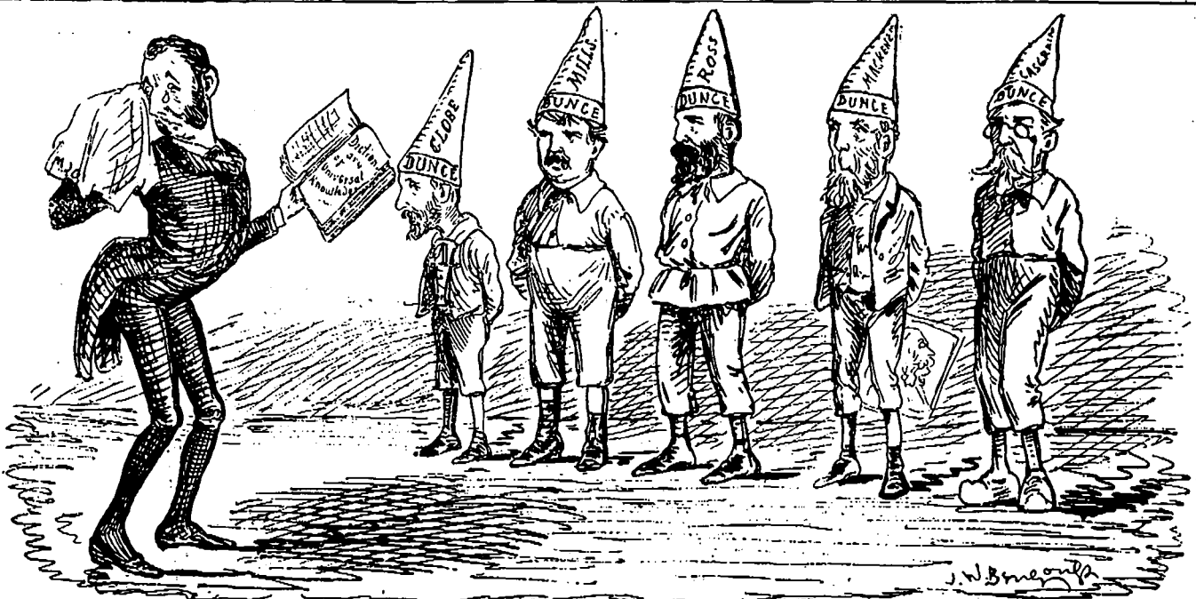
THE "MAIL" EDITOR AND THE GRIT DUNCES.

"THE GLOBE SPELLS MACAULAY WITH AN E; MR. MILLS SPELLS GUICCIARDINI WITH ONE C; MR. ROSS SAYS IT WAS XERXES WHO COMMANDED THE TIDE TO TURN BACK; MR. MACKENZIE DENOUNCES ALL THE PICTURES AT OTTAWA AS "RUBBISH"; MR. CASGRAIN SAYS LORD SHAFTESBURY IS THE LEADER OF THE TORY OPPOSITION IN ENGLAND"!!!—MAIL, Monday, 30th April.