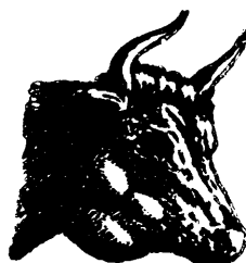
Trade Mark Reg d.

Lump Jaw has heretofore baffled treatment. It has infected herds and pastures, and caused loss of hundreds of thousands of dollars. This new remedy cures quickly, thoroughly, and permanently. Leaves jaw smooth and sound. Easy to apply; costs but a trifle compared with results.