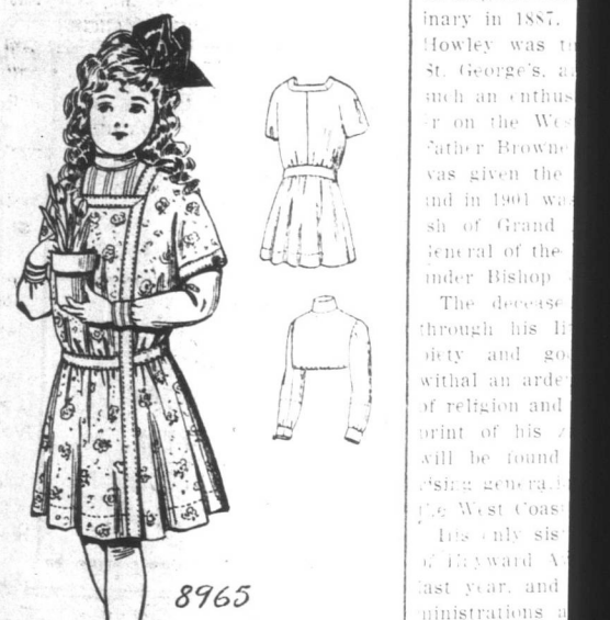
Girl's Dress With Side Closing and Tucker.

Made of figured challie, with bands of satin for trimming and tucker of the tucking, this model was very effective. It may be worn without the tucker. The gathered skirt and full waist with kimono sleeve close at the left side, which is a practical and good feature. The pattern is cut in 5 sizes: 4, 6, 8, 10 and 12 years. It requires 2 1/2 yards of 40 inch material for the Dress and 5/8 yard of 36 inch lawn for the Tucker for the 6 year size. A pattern of this illustration mailed to any address on receipt of 10c. in silver or stamps.