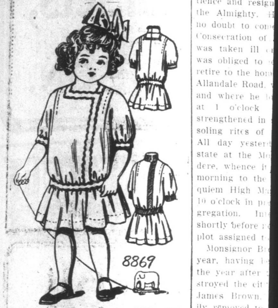
Girl's One Piece Dress With Bodice and Sleeve in One.

The little dress shown here is dainty enough for a "party" or "best" dress if made of soft pretty material and will also prove a serviceable model for general wear if developed in gingham, galates, cashmere, serge or flannel. With a trimming of embroidery or braid put on as illustrated the effect of a front closing may be simulated. The design may be finished with the Tucker or in low neck style. The pattern is cut in sizes: 2, 4, 6 and 8 years. It requires 3 1/2 yards of 36 inch material for the 6 year size. A pattern of this illustration mailed to any address on receipt of 10c. in silver or stamps.