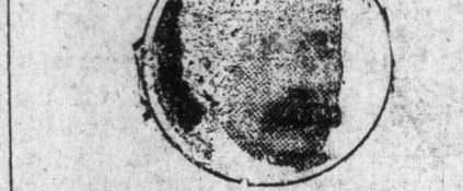
HON. J. A. CALDER, Western Liberal Member of the Union Cabinet, who it is predicted will succeed Premier Borden.

This announcement will interest many women here, for it is said that the present high heel footwear is putting corns on practically every woman's feet.