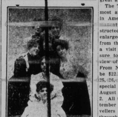
"Buds of the Big Beauty Chorus" in "Seven Hours in New York"

It is said that the musical comedy, "Seven Hours in New York" is astonishing the theatre managers everywhere by the tremendous business it is attracting.