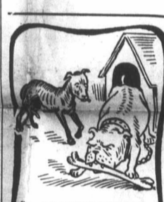
'A MODEST DOG SELDOM GROWS FAT'