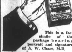
This is a facsimile of the package bearing a portrait and signature of A. W. Chase, M.D.

There are many imitations of this great treatment for coughs, colds, croup, bronchitis and whooping cough. They usually have some sale on the streets of the original, but it would be remembered that they are like it in name only.