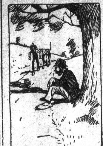
"PRETTY SOON A FARMER CAME ALONG LEADING THE BULL."

"I took in the county jail as part of the programme," continued the wanderer with a smile, "and I got it all. The first time I was arrested I let