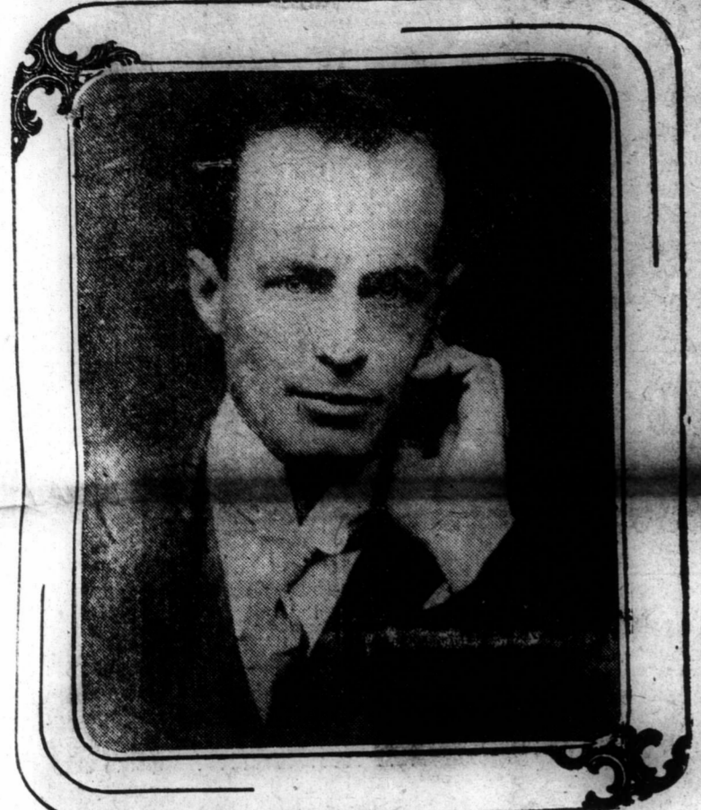
DR. DOUGLAS MAWSON.

Relief arrived just in time to save the lives of Dr. Douglas Mawson, the Australian Antarctic explorer, and his five companions, who were left in March last on Macquarie Island, in the Antarctic Ocean, when the remaining twenty-four members of Dr. Mawson's expedition returned to Tasmania on board the Aurora from their polar trip.