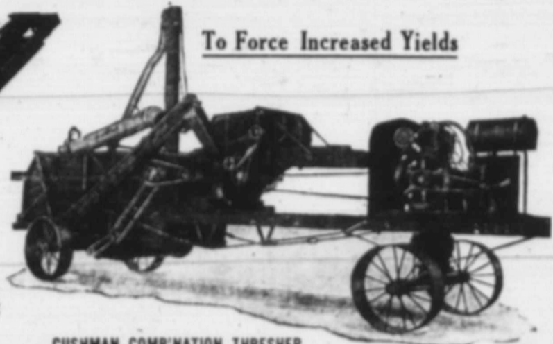
CUSHMAN COMBINATION THRESHER

The best individual outfits on the market. The famous Light Weight Cushman Engine, mounted on same truck with separator.