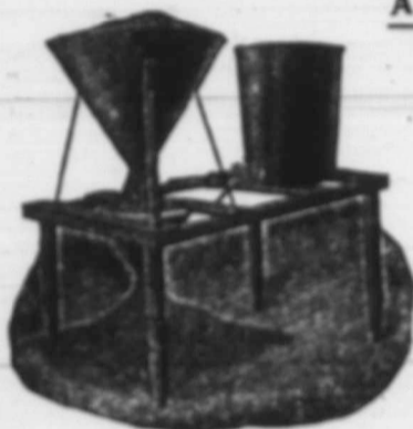
The Automatic Grain Picker

This is the only machine of its kind in use. Handles grain at the rate of 125 bushels per hour. Light in weight. Perfect in action. Fully guaranteed. Substantially built. Thoroughly soaks, turns over and treats the grain. The only picker with the turbine principle.