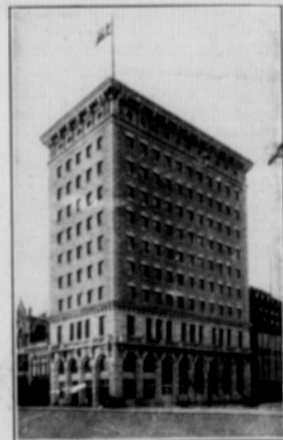
Head Office, Winnipeg