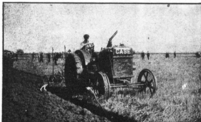
The Outfit that took Second Prize. A Grand Detour 3 Bottom Rigid Beam Plow and a Case 15-27 Kerosene Tractor