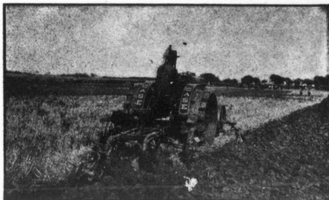
The Outfit that took First Prize. A Grand Detour 2 Bottom Rigid Beam Plow and a Case 10-18 Kerosene Tractor