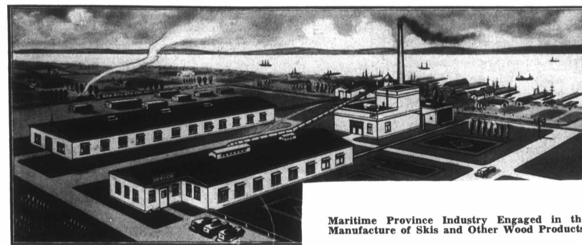
Maritime Province Industry Engaged in the Manufacture of Skis and Other Wood Products.

Secretary, Board of Trade, Halifax, N.S.