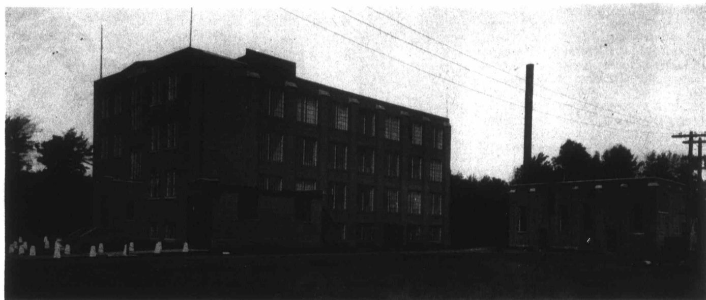
Another Example of Expansion in the Textile Industry.

The plant at Drummondville, Que., of Louis Roessel & Co. Limited, manufacturers of broad silks of all kinds, which was started just 10 years ago. It contains 100 looms and 2,200 spindles, employs about 150 hands and has been running to full capacity ever since it started.