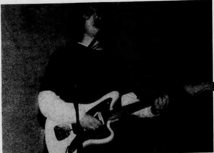
My Bloody Valentine brings us into the realm of the shoe-gazers, an existential realm of pulsing, tearing chaos. Despite this, My Bloody Valentine's recent concert gave Toronto something to think about: hopelessness and hope together.

My Bloody Valentine don't make too much of an entrance. In fact, they don't move much at all. This is the realm of the shoe-gazers — an existential realm, a pulsing, tearing chaos of a realm. A great sense of the band as stone emerges: they are immutable,