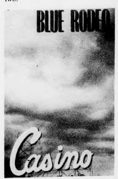
Casino produces some exciting moments but the Rodeo guys' attention seems diverted by too many musical styles.

produce some exciting moments. Unfortunately, Blue Rodeo's attention seems apparently diverted by their pursuit of many alternative sounds. Thus as a consequence the potential of a really great album is manifested into only a good album. Still, Casino is indeed worth a spin or