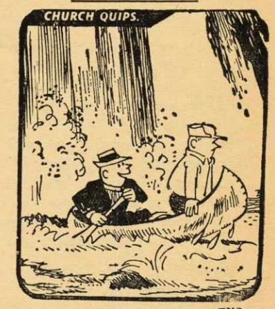
"You can relax now. We've gone over the biggest bump.

THE INTERNATIONAL NICKEL COMPANY OF CANADA, LIMITED 55 YONGE STREET, TORONTO