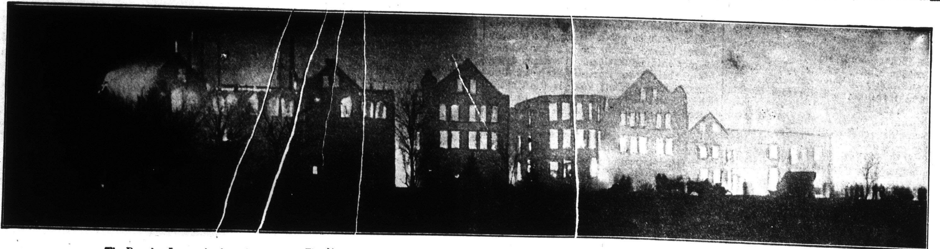
The Brandon Insane Asylum destroyed by Fire Nov. 4th. Photograph taken for the Western Home Monthly at 7:30 p.m. during the progress of the fire.