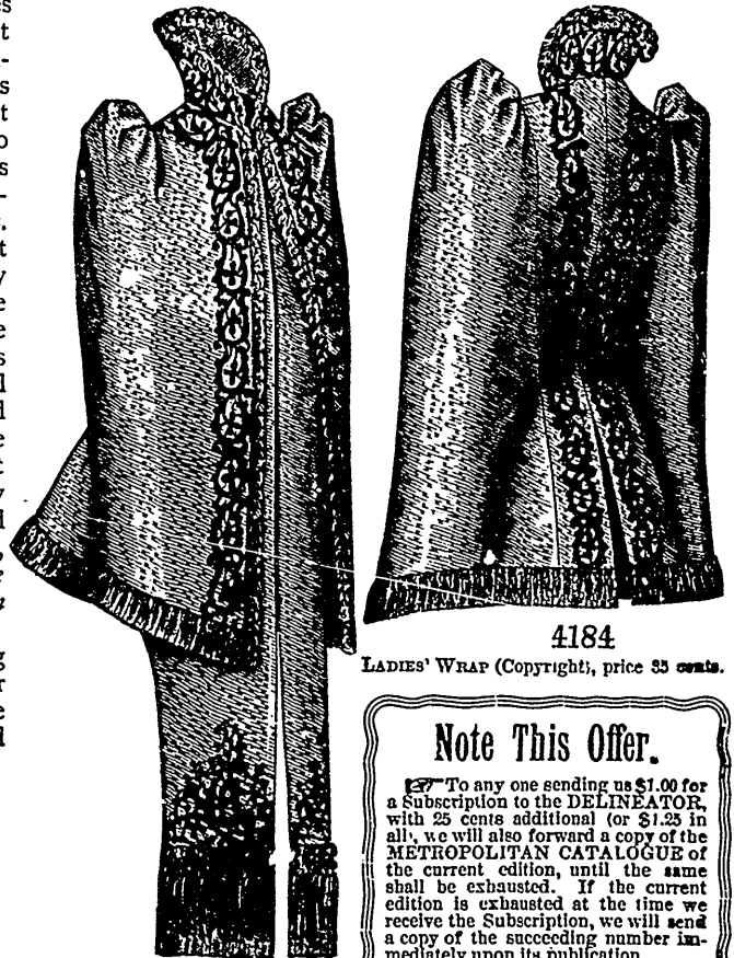
4184 LADIES' WRAP (Copyright), price 35 cents.

Having been prepared in view of much handling (being especially calculated for the sales-counters of our Agents), this Catalogue is excellently adapted to the needs of Dressmakers and Manufacturers of Ladies' and Misses' Clothing.