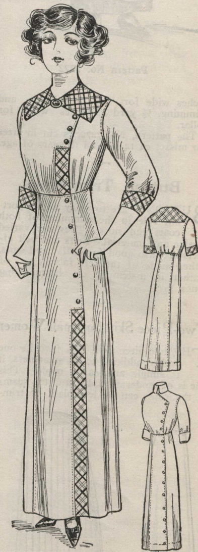
Pattern No. 7340

SEMI-PRINCESS gowns such as this one can be made from many different materials, and consequently, are adapted to many uses. In the illustration mohair is trimmed with plaid silk and the gown is adapted to afternoon