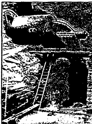
Sherbrooke Street Railway Power Plant— 45 inch Crocker Wheel in Horizontal Setting.