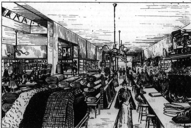
View of Interior of New Annex, 170 Yonge Street.

DR the newest the largest in greatest colorings a show touch tangles of at first-han