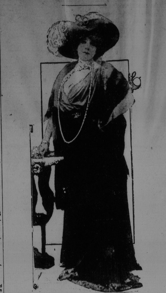
SARAH BERNHARDT, HER BEST PHOTOGRAPH.