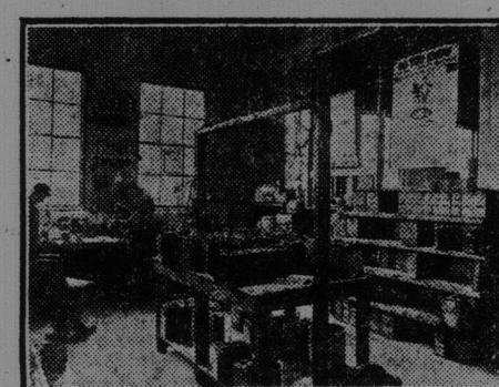
A VIEW OF BATTERY ROOM

STORAGE BATTERY AND ELECTRICAL REPAIR DEPT.