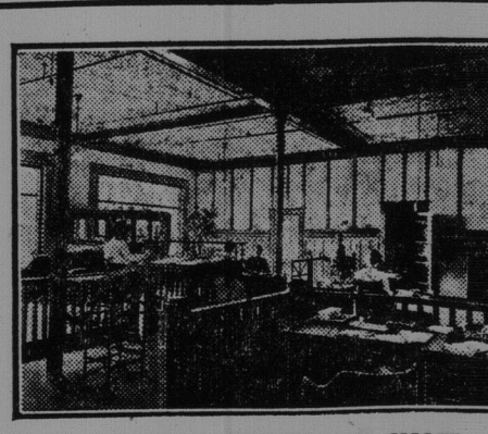
GENERAL OFFICE AND SHOW-

We have some ten thousand square feet of cement floor space available for winter car storage for owners and dealers who have not sufficient space at exceptionally low rates considering the special services rendered, and a big saving is also effected in cost of insurance and freedom from damage to car through careless handling or dampness. Rates quoted on application.