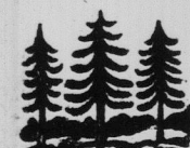
Dr. Wood's Norway Pine Syrup