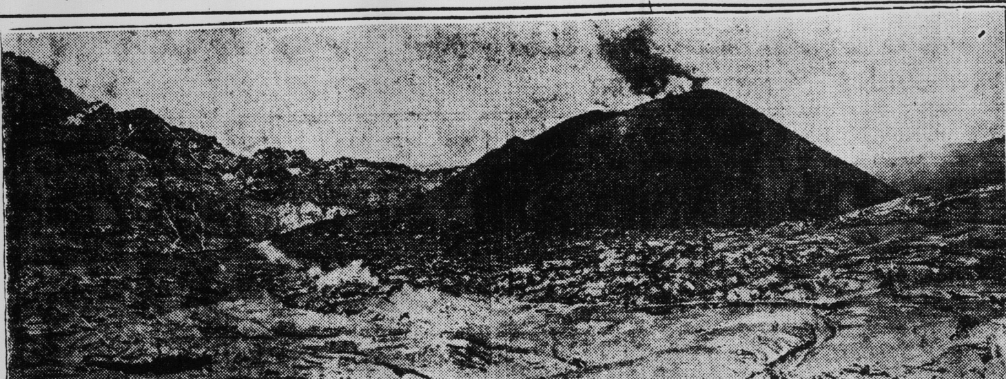
Belching smoke and flame, Mount Vesuvius has awakened after 16 years of comparative quiet. A stream of molten lava is flowing from the central crater, destroying everything in its path. This view shows the central cone of the volcano surrounded by the desolate stretches of lava hurled out in former eruptions, and beyond the rim of the main crater.

rush of refugees in August 1914, and her personality, knowledge and her linguistic abilities — she could speak English, French, German and Italian — convinced our Secret Service that she was just the right woman to organize intelligence on the other side.