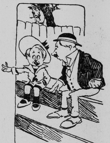
DECISION AGAINST THE HOME

The Small Boy-Oh! father, the umoire is putting on a mask. His Father—Yes, my boy. No wonder