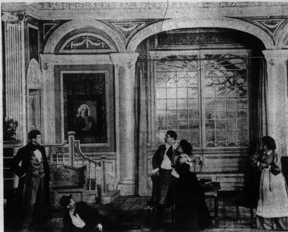
SCENE FROM BARTLEY CAMPBELL'S FAMOUS PRODUCTION OF "THE WHITE SLAVE," THE OFFERING AT THE GRAND ALL THIS WEEK.