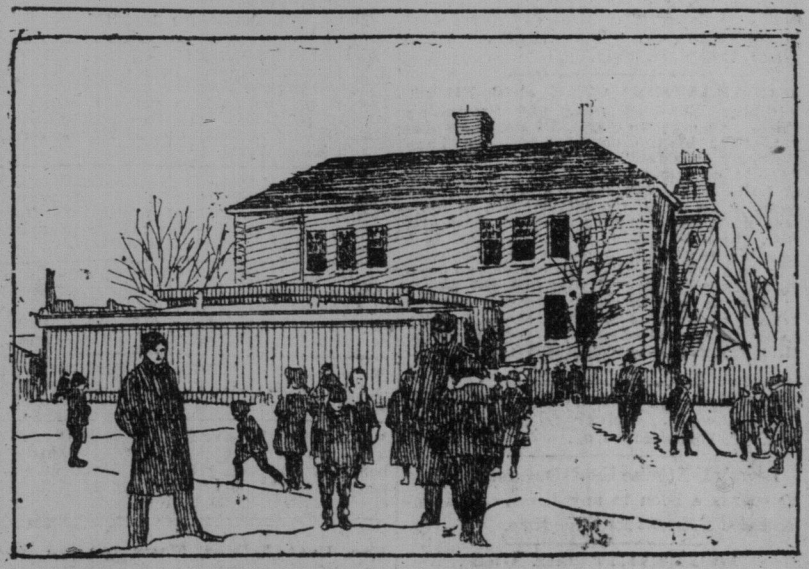
in the Russo-Japanese conflict the provisions of the InternaArbitration Tribunal at The JESSE KETCHUM SCHOOL, WESTERN WING, DAMAGED BY