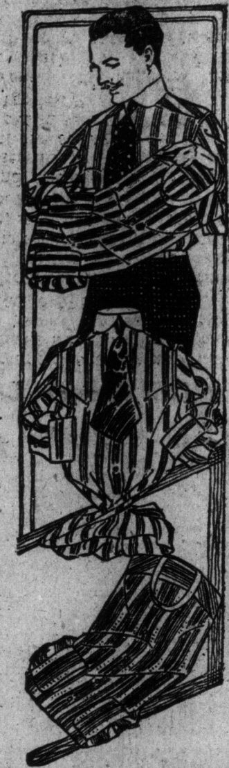
The Latest Thing---The Greatest Thing in Shirts---These New

Here is the very model that pleases both the young fellow and his parents. It is made of soft brown vicuna, in double-breasted style, showing yoke back with twin inverted pleats. Price, $28.00.