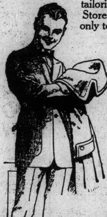
For the Dashing Young Chap Just Out of His "Teens," This Tweed Suit $28.00

Among the better-dressed younger set you'll find this ultra-fashionable model. Its every line and curve suggests refinement and dignity, despite the fact that it is cut with plenty of "swing" and "go." You will like its high-fitting collar, its soft military-styled shoulder and its long modified form-fitting front and back. Developed in three-button single-breasted style. Noteworthy value at $28.00.