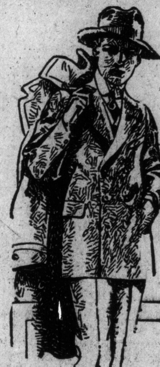
For the Hard-to-Fit Very Young Chap, Suit $28.00

Made with long sweeping front, closely-fitted back, patch pockets, and soft roll lapels and front. It has detachable belt. Can be worn as two or three-button model. Good value at $28.00.