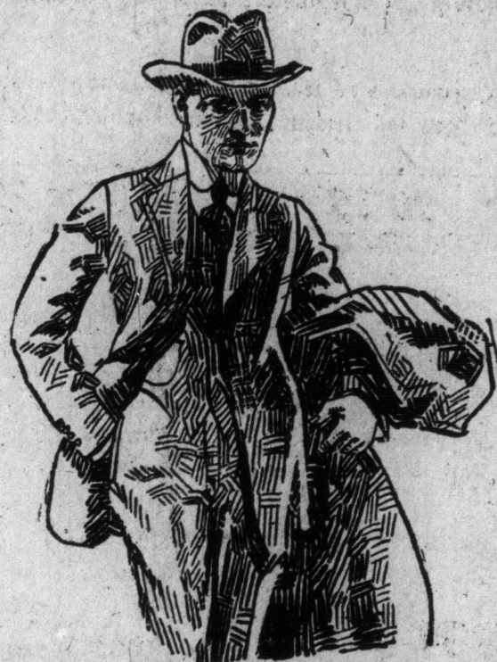
For the Particular Young Business Man

Designed in single-breasted, three-button, form-fitting style, having deep centre-vent. Splendid value at $28.00.