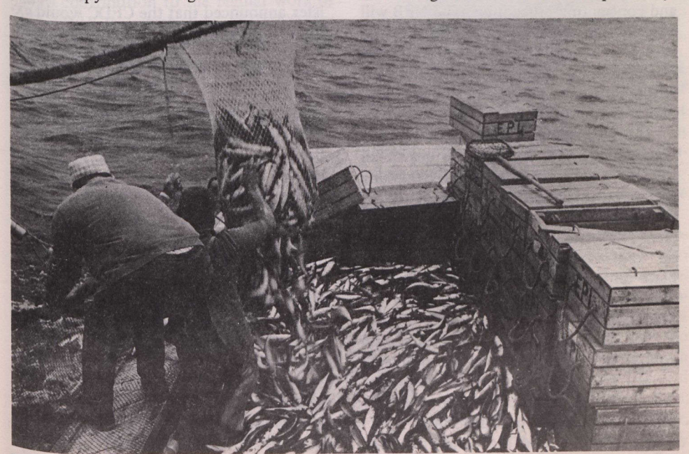
Fishermen haul in a good catch of mackerel off the coast of New Brunswick.

Until Canada's introduction of the 200-mile fishing zone on January 1, 1977, Canadian and foreign fishermen were in direct competition for the same fish. Restricting use of Canadian ports by