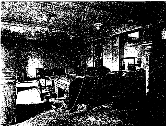
OFFICIALS' PLATFORM ON MAIN FLOOR.