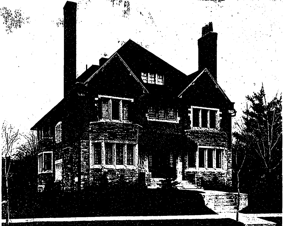
RESIDENCE OF GEORGE H. SHAW, TORONTO.

was made to take advantage of the southern exposure. The dining room on the southeast corner receives the benefit of the morning sun. The interior finish of the house is simple, but the best materials obtainable were used through-