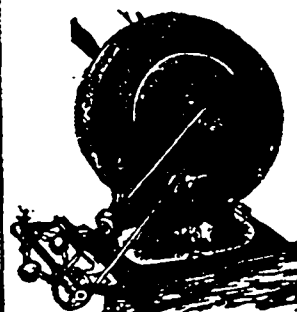
View of Tuerk's Pressure Motor, with Tuerk's Improved Governor Attachment.

For running Sewing Machines for families or for manufactories; also, for running Dental Lathes and Engines, Telephone Generators, Coffee Mills and Reasters, House and Church Organs; also for running one Printing Press or six, at the same time. Paper Cutters, Sausage Machines of any make or size; GRAIN, FREIGHT OR PASSENGER ELEVATORS, Straw Cutters, and all kinds of Machinery by Water Power.